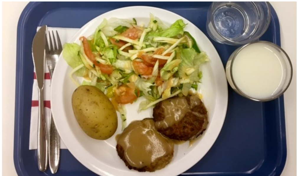
Rastaala School lunch on Wednesday, January 25th

The new recommendation says that it is important to eat together and take your time. Fish, another white meat and vegetable food could add to school food more. In schools people ate lots of soups and porridges at 1959. According to the National Institute for Health and Welfare, "School food is successful, when it is inviting for everyone."